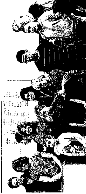
Parkland Student Council